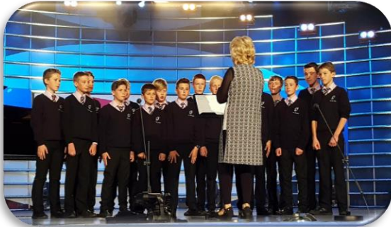
Junior Boys Party – Urdd Eisteddfod Y Fflint