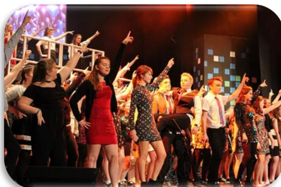
School Musical – 'Chwarae Cuddio'