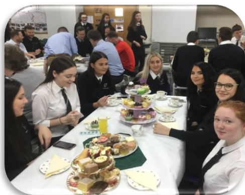
Macmillan Coffee Morning 2018