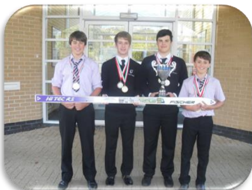
School Skiing Champions

In addition to volunteering, Year 12 pupils organize activities to raise money for good causes. The money raised at these events, organized and supported by pupils and school staff, is given to a variety of local and national charities.