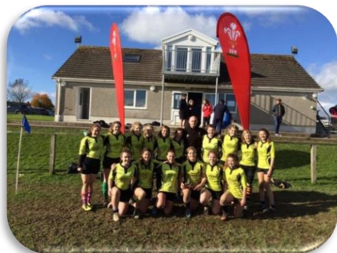
Girls Rugby Team – Under 18 Scarlets District Champions 2016