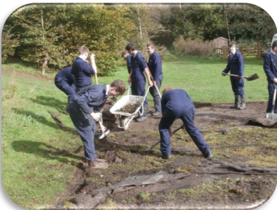
Construction Pupils creating an outdoor learning environment