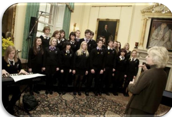
School choir's visit to Number 10, Downing Street