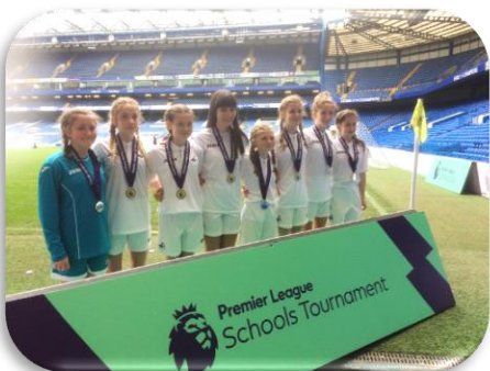
Year 8 Girls Football Team – Premier League Schools Tournament

There are opportunities for pupils to study Physical Education to GCSE and A Level. The school offers the Duke of Edinburgh Bronze Award and there are opportunities for the older pupils to lead and coach the younger pupils. Year 12 pupils have the opportunity to attend other appropriate training courses for particular activities. They also assist with sports activities such as those of the Urdd.