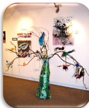
Year 12/13 Art display

The school is a member of the Seren Hub activities programme, a Welsh Government initiative, which supports the school's more able and talented Sixth Form students to fulfil their academic potential and win places at leading UK universities. There will be future opportunities for more able and talented pupils in KS3 and KS4 to take advantage of the programme.