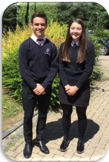
Head Boy and Head Girl

As we strive to achieve these objectives, we emphasise the importance of the partnership and collaboration between pupils, staff, parents and governors.