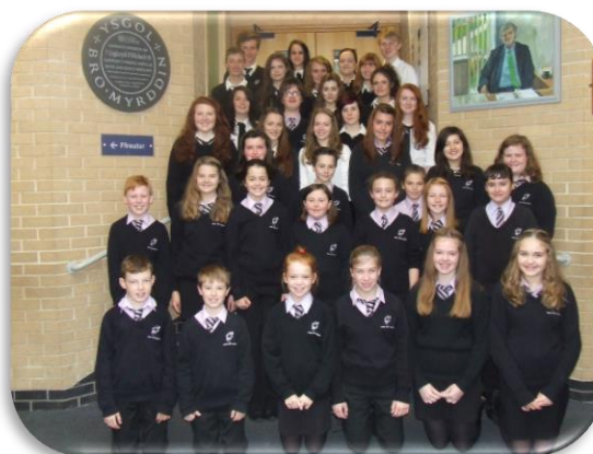
The school's Eco Committee