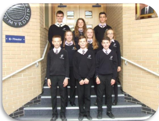
Sports Council 2017 - 2018