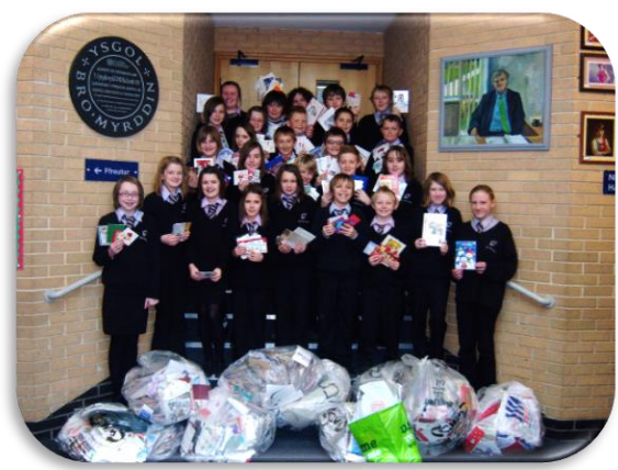
Christmas Card Eco Challenge