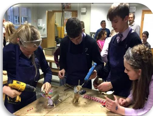
Pupils at work at the Open Evening

Parents can withdraw pupils from Religious Education and Sex Education lessons by writing to the Headteacher.