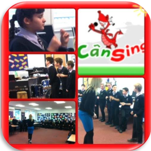
Cân Sing Workshop