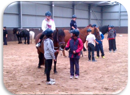
Year 7 learning to ride at Llangrannog