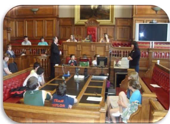
Year 10 visit to the Crown Court