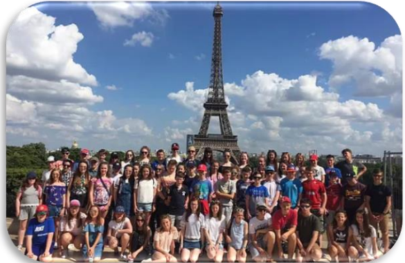
Year 8 Trip to France