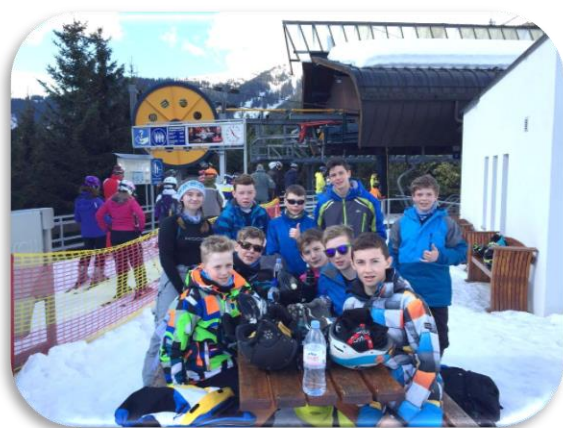
School Skiing Trip 2016