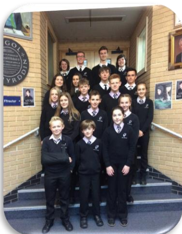
School Council 2017 - 2018