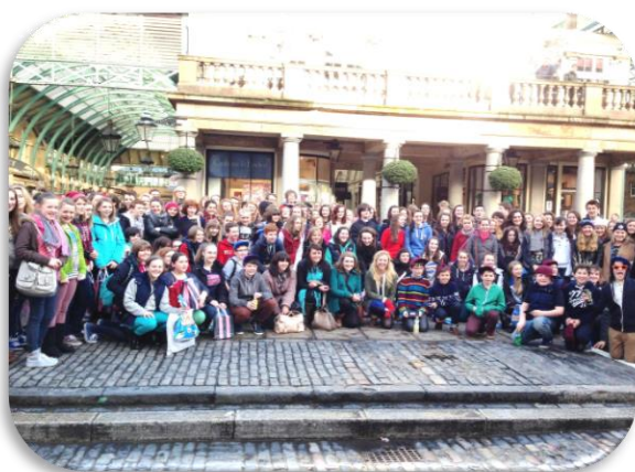
The Music Department's visit to London