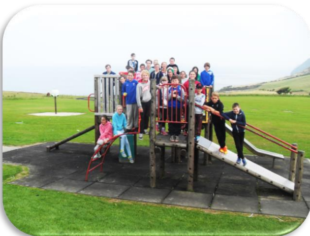
Year 7 pupils at Llangrannog