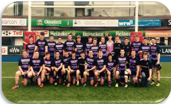
Bro Myrddin Firsts – Welsh Champions 2017