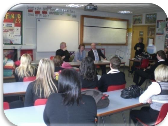
Local Ministers of religion in a 'Question time' session Sixth Form students