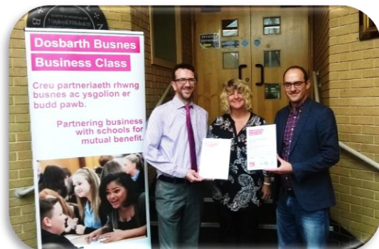
Celebrating the partnership with the Principality