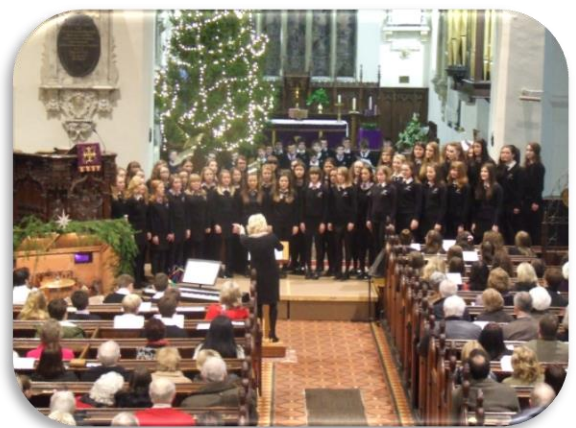
The Christmas Carol Service