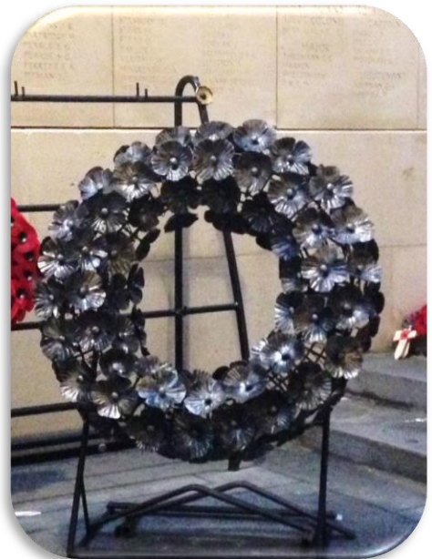
Wreath laid during the Last Post Ceremony at the Menin Gate; some poppies made by pupils