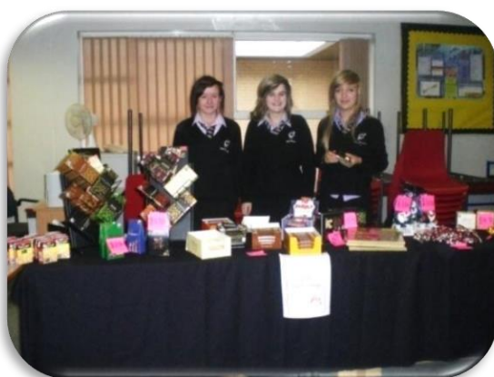
Pupils on the Fair Trade stall in the Open Evening