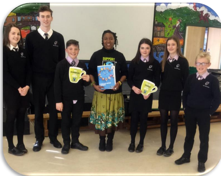
Eco School Conference Bro Myrddin Cluster 2017

The Parent Teachers Association is here for the benefit of our youth. Every penny raised during the year will be spent on our children. Thank you for your support for the activities this year and I'm completely confident that the school's outstanding success will continue.