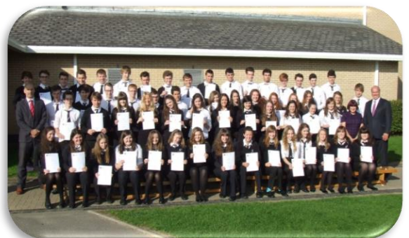
Presenting Certificates to the Going for Gold Students