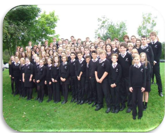
Cast and company of the school musical