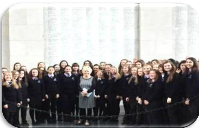
Senior Girls Choir visiting Ypres to sing at the Last Post Ceremony at the Menin Gate

Welsh is the official language of the school for extracurricular activities and the vast majority of academic lessons. The school is proud of its Welsh ethos and actively ensures that this is maintained for each new cohort of pupils. It is compulsory for all pupils who choose to attend the school to speak Welsh, around the school, during extracurricular activities and in lessons that are taught in Welsh. Parents are asked to support the school in this regard by encouraging their children to speak Welsh, to respect the school's Welsh ethos and to encourage them to do their best to promote this at all times.