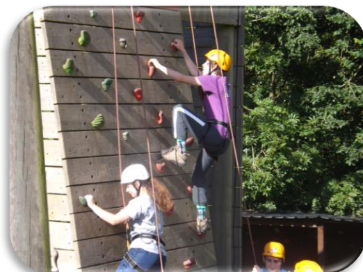
Year 12 students on an induction course at Morfa Bay