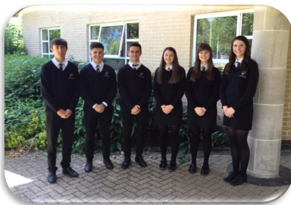
Head Boy and Head Girl and their Deputies